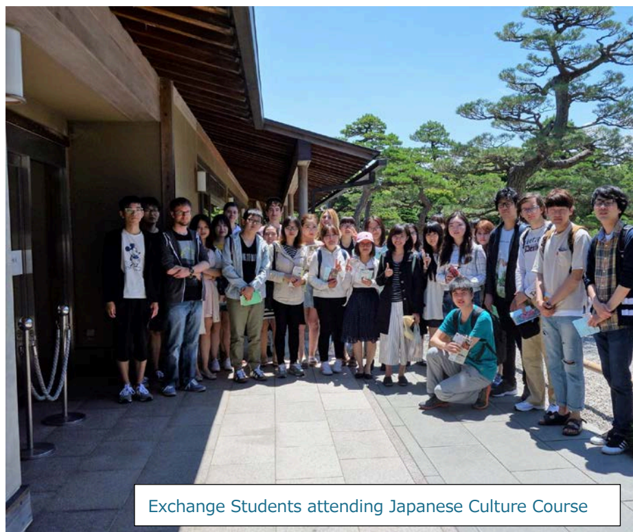
Exchange Students attending Japanese Culture Course