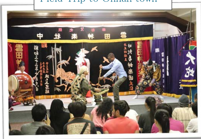
Field Trip to Ohnan town

They are held by the Center for International Exchange of Shimane University which will provide you with some financial aid.